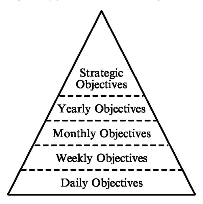
Figure (1): Pyramid of Objectives

Making a timetable for objectives is of great value when measuring efficiency and effectiveness of their achievement within the defined period. Activities within that period are to be arranged in accordance with priority of objectives or details so that objectives can be reached as scheduled.